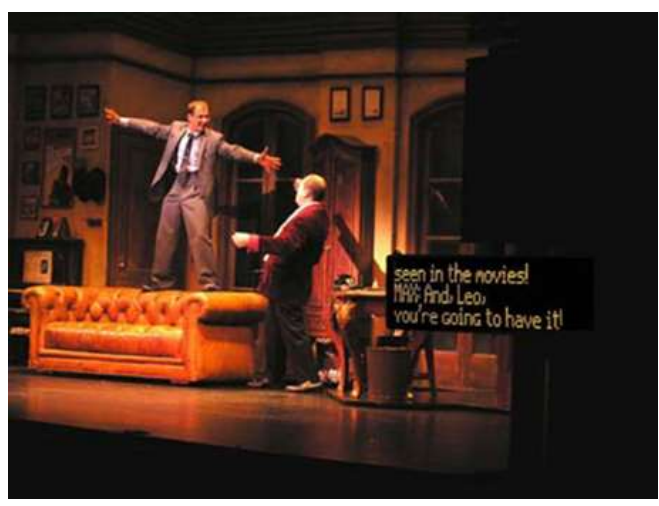
Closed captioning is provided for an audience at a live theater show.