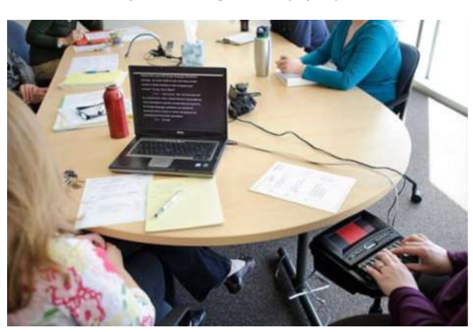
CART is provided for an individual with hearing loss on the individual's personal laptop at a work meeting.

Hearing loss can be a frustrating and isolating experience, but it doesn't have to be. Understanding your rights to communication access and the availability of auxiliary aids and services can greatly enhance your ability to communicate and participate in life. The resources listed on the following page offer more information about additional supports, available technology, and your legal rights.