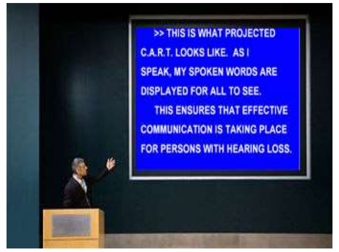
CART is provided for an individual with hearing loss on a large screen at a conference.